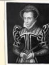
Mary I Reigned from 1553 - 1558