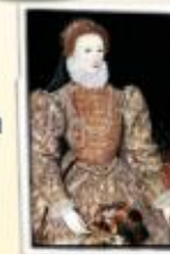
Elizabeth I Reigned from 1558 - 1603