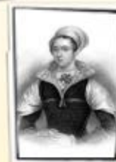
Jane Grey Reigned for nine days in 1553