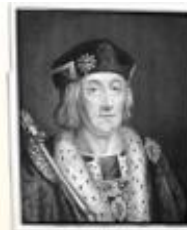
Henry VII Reigned from 1485 - 1509