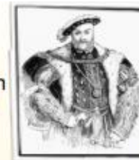
Henry VIII Reigned from 1509 - 1547