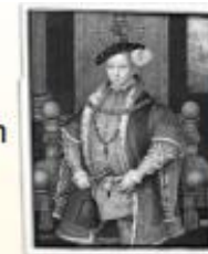
Edward VI Reigned from 1547 - 1553